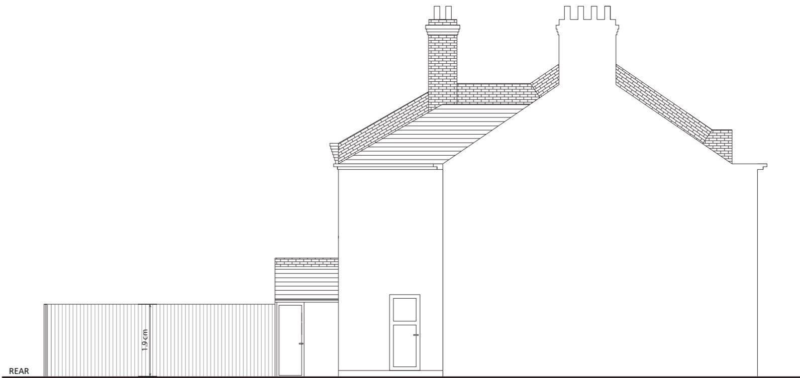
SIDE ELEVATION (SW) AS EXISTING