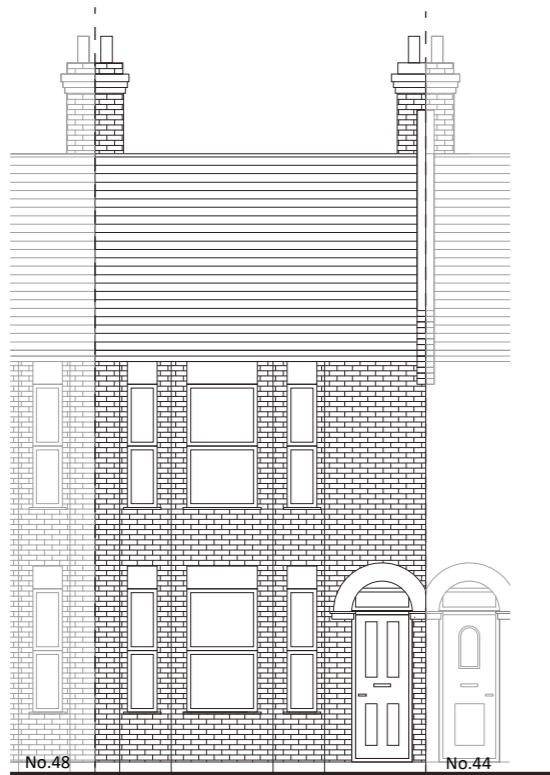
FRONT ELEVATION (NW) AS EXISTING