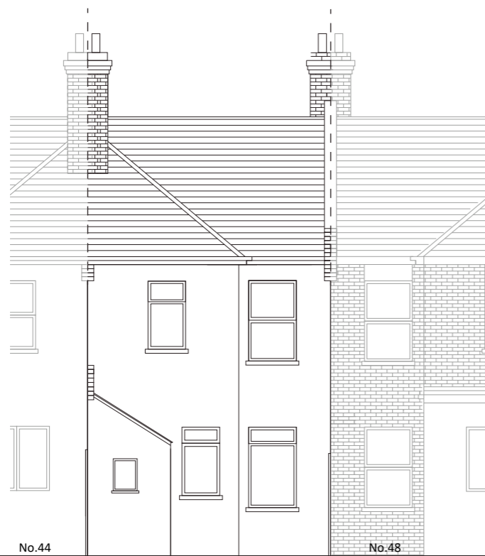
REAR ELEVATION (SE) AS EXISTING